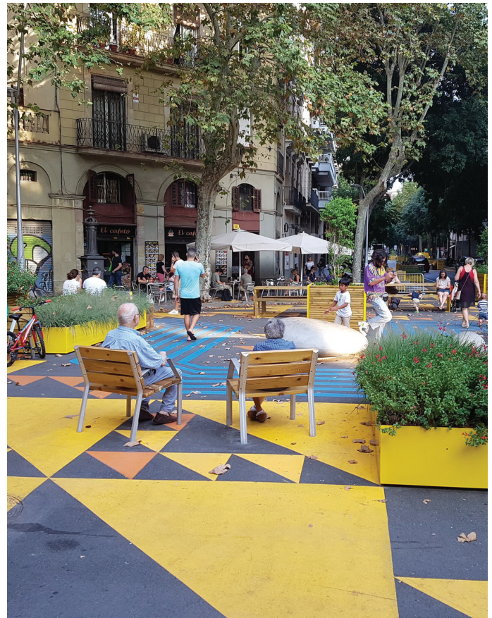
Reclaiming the commons