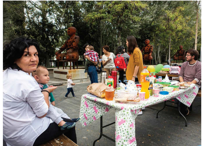
Neighbours in Barcelona celebrating a birthday