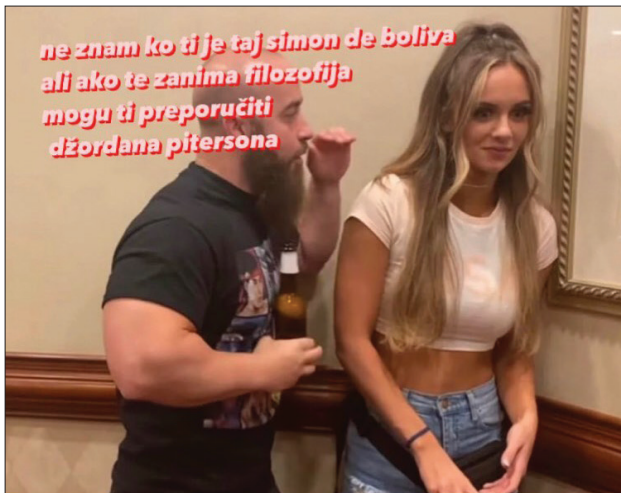
Don't know who that guy Simon de Boliva is, but if your interested in philosophy, I really recommend Jordan Peterson