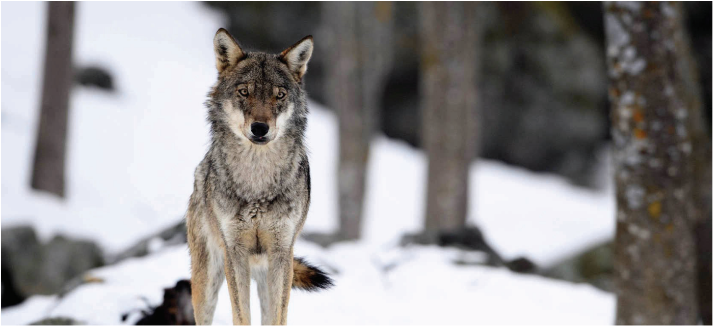
Live WolfAlps EU

balance our needs for survival above subsistence levels while working less and sharing our collective resources.